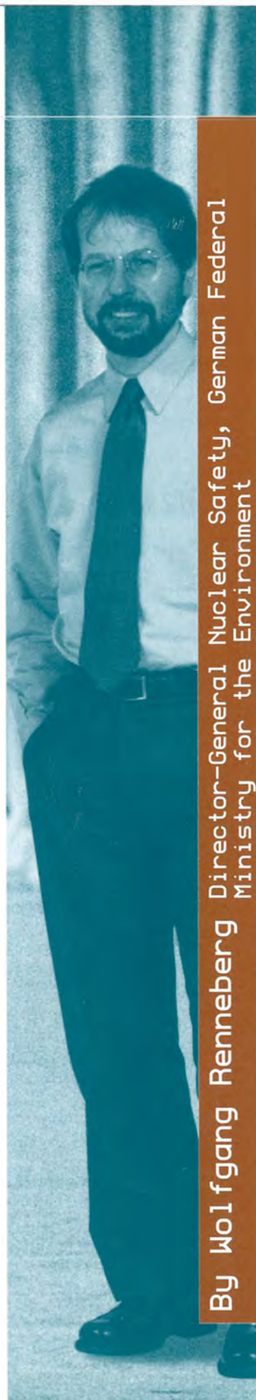
By Wolfgang Renneberg Director-General Nuclear Safety, German Federal Ministry for the Environment

› Insights and perspectives. The investigations have demonstrated that the original idea of negligible risk during shutdown because of a large grace time is not valid for all states. In addition to the findings related to plants safety, the PSAs have underlined that in many cases the knowledge of the plant behaviour during an accident sequence was insufficient. For example, in order to assess the physical consequences of the injection or forming of unborated water in the primary circuit, it was and still is necessary to perform neutronics and thermalhydraulics calculations, and even experiments. The consequences of a cold overpressure also require physical and mechanical studies for some plants. PSA for shutdown situations has so far led to significant safety improvements of the plants and also to a knowledge improvement about the plant's behaviour during particular accident situations for which studies are still ongoing. In particular in Germany a PSA for shutdown states of a BWR of the 69-type has been started. ■