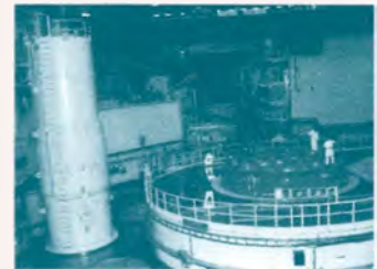
Reactor vessel at Paks Nuclear Power Plant, Hungary.

▼ In this process, European and international cooperation in the field of nuclear power plant shutdown is of utmost importance to us, since highly developed safety practices are a valuable source of inspiration. ●