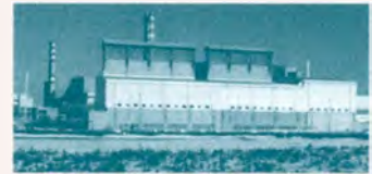
Paks Nuclear Power Plant, Hungary.