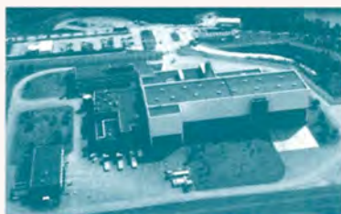
CLAB interim storage facility at Oskarshamn, Sweden.

released by a fire, even an ordinary fire with no nuclear accident affecting the public. We also discussed how to define the moment when the station becomes a normal industry for the public: does it start when the fuel is removed? Or is it when the site has reverted to greenfield?