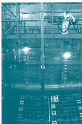
Fuel assembly transfer from storage pool towards reactor pool.