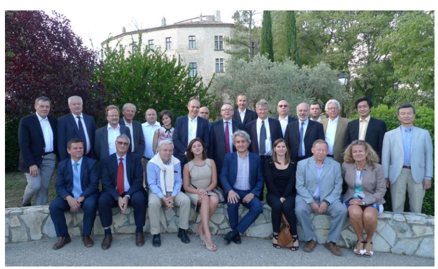
ETSON General Assembly Meeting, Cadarache (France), 9 July 2014

Discussions are engaged with other European TSOs to enlarge the network.