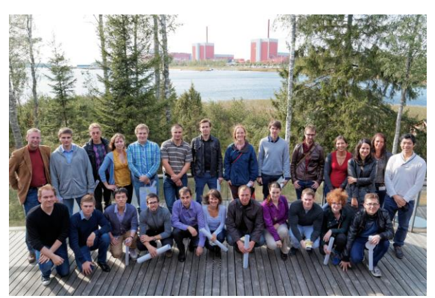
JSP in Finland (August 2014)

It was decided that PSI (Switzerland) will host the ETSON JSP Summer Workshop 2015. The general topic will be "Material properties aspects in nuclear safety".