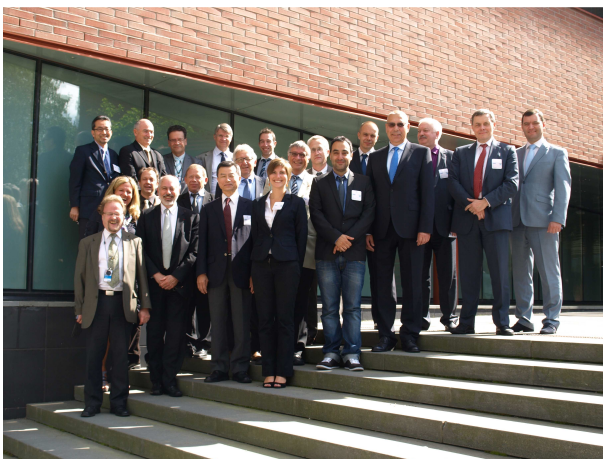
ETSON General Assembly meeting, Helsinki (Finland), 28 June 2012 , © VTT

Further applications have been submitted by Jozef Stephan Institute (Slovenia) and INRNE (Bulgaria).