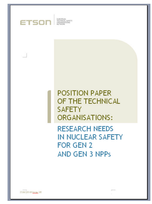
The TSO Paper is also available on the ETSON website.

The ETSON "Position Paper of the Technical Safety Organisations: Research needs in nuclear safety for Gen 2 and Gen 3 NPPs" (TSO Position Paper) is now printed as an ETSON report and has been sent to the Sustainable Nuclear Energy Technology Platform (SNETP), the European Commission and international ETSON's contacts, including the International Atomic Energy Agency (IAEA) and the Nuclear Energy Agency (NEA).