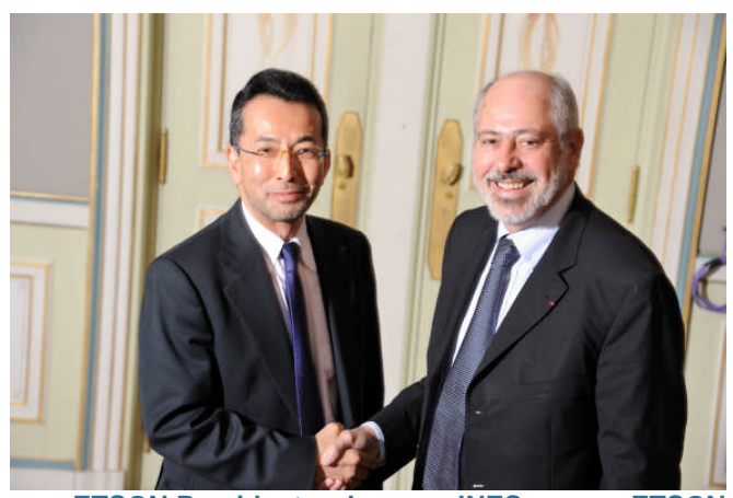
ETSON President welcomes JNES as new ETSON Associated Member

As a consequence, the amount of the budget and the detailed incomes and expenses will be detailed in a specific annex of the next annual report.